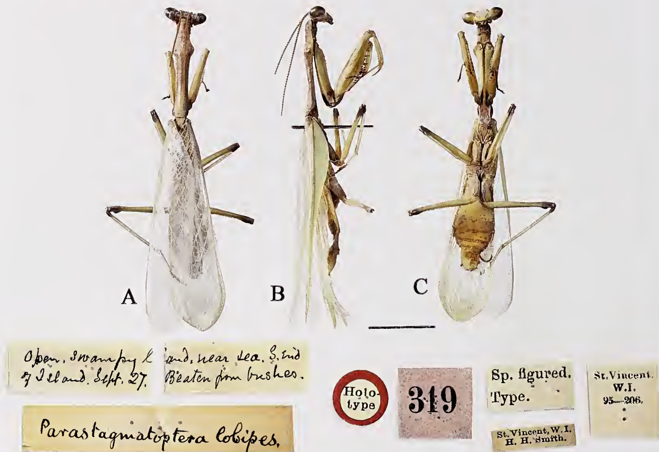
Fig. 6. Holotypus of Parastagmatoptera lobipes . (A) Dorsal view. (B) Lateral view. (C) Ventral view. Scale 1 cm.

Torax: pronotum slender, about 4.31 times as long as the pronotal supracoxal dilation and 8.9 times as long as its minimum width; lateral margins with small denticles; supracoxal dilation not very developed and with lateral margins widely rounded. Disc of prozone with minute granules; disc of the metazone with an indistinct median carina extending about 1/3 of its length; ratio metazone/prozone is 2.8. Fore legs slender: coxae (Fig. 2) 0.62 times as long as the pronotum, prismatic with a triangular section; inner surface with a black band covering about 1/3 of the length of coxae; all margins with small tubercles with an apical short hair; inner distal lobes divergent. Femora 5.15 times as long as its maximum width, upper margin almost straight, all spines ochre with brown apex. Tibiae reaching half the length of the femora, all spines green with brown apex. Spination formula F=14-16IS/5ES/4DS and T=14-15IS/11ES. Middle and hind legs slender; femora smooth, tibiae and tarsi with scarcely hairs. Posterior metatarsi 1.6 times as long as all other segments together. Wings well-developed, extending well beyond the apex of the abdomen; mesothoracic wing opaque about 2.8 their maximum width, with numerous